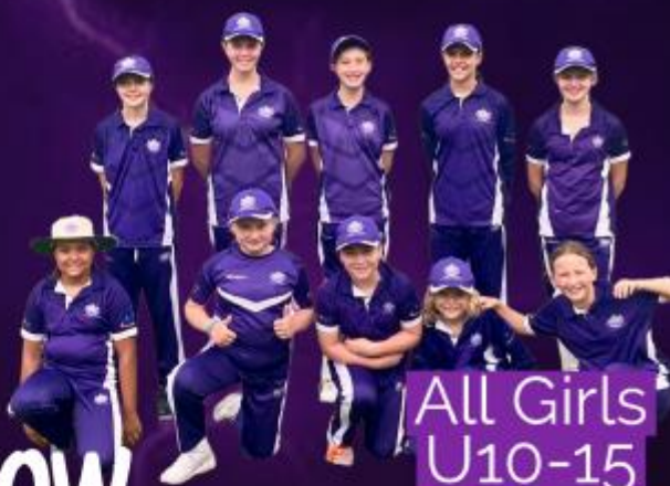
All Girls U10-15