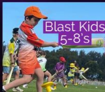
Blast Kids 5-8's