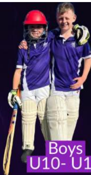
Boys U10- U16