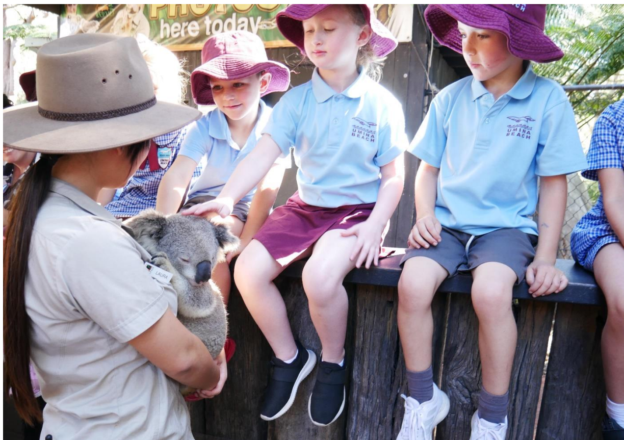
Kindergarten visit the Reptile Park

Term 3, Week 8 Tuesday 10 September, 2019