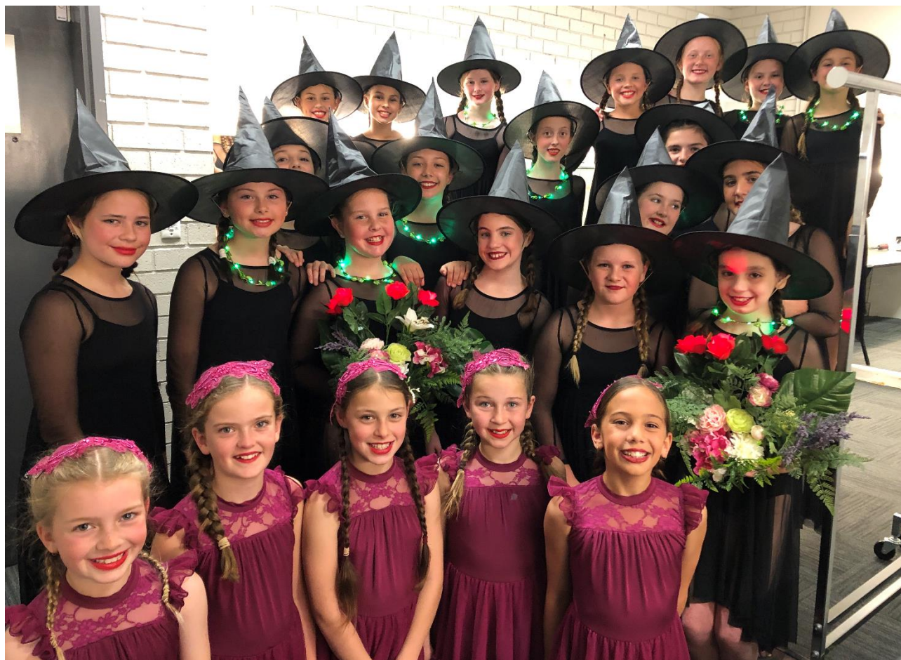
Stage 3 Dance Group