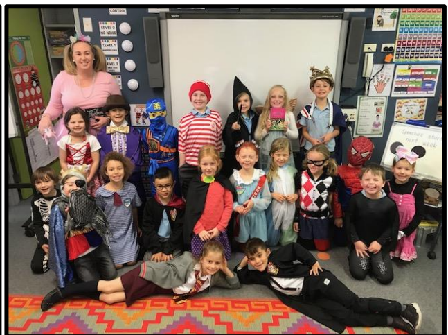
1M – Book Week Monday 19

Advertisers support our school – please support them