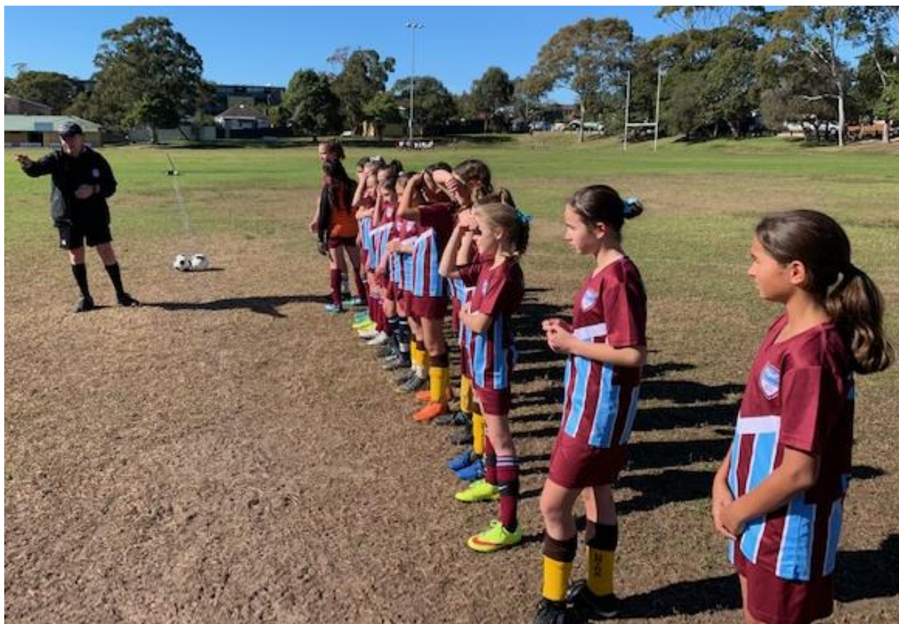
UBPS Girls Soccer Team