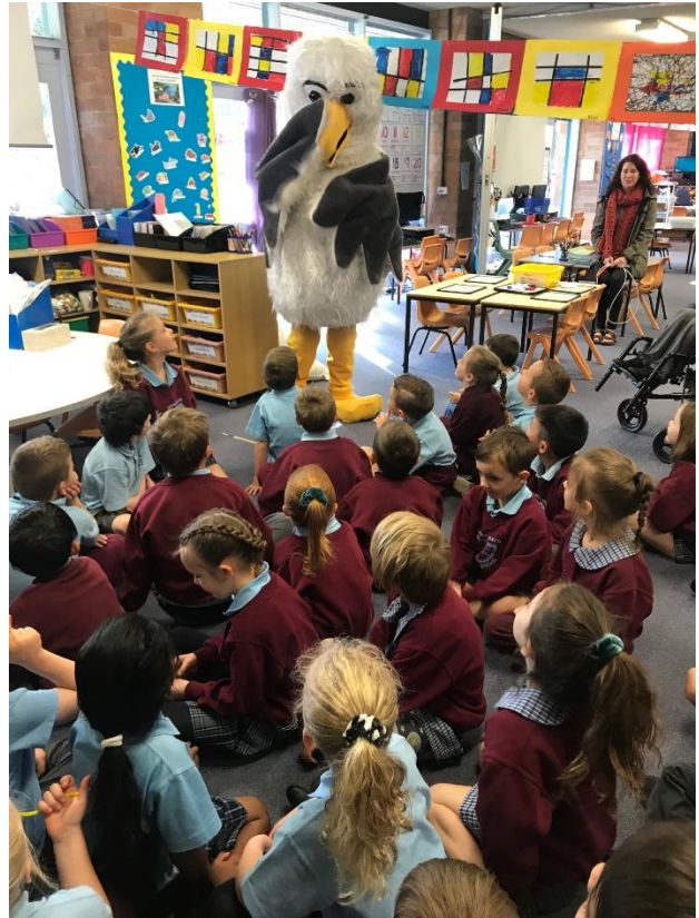
Salty visits the students