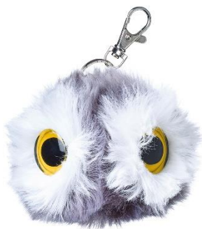
Arctic Owl Fluffy Keyring

Exciting new Term 3 Polar Savers rewards are now available, while stocks last!