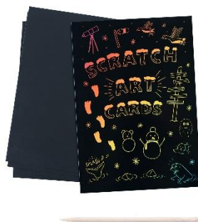
Scratch Art Cards

For every deposit made at school, students will receive a silver Dollarmites token. Once students have individually collected 10 tokens they can redeem them for exclusive School Banking reward items in recognition of their regular savings habits. There are two new items released each term so be sure to keep an eye out for them!