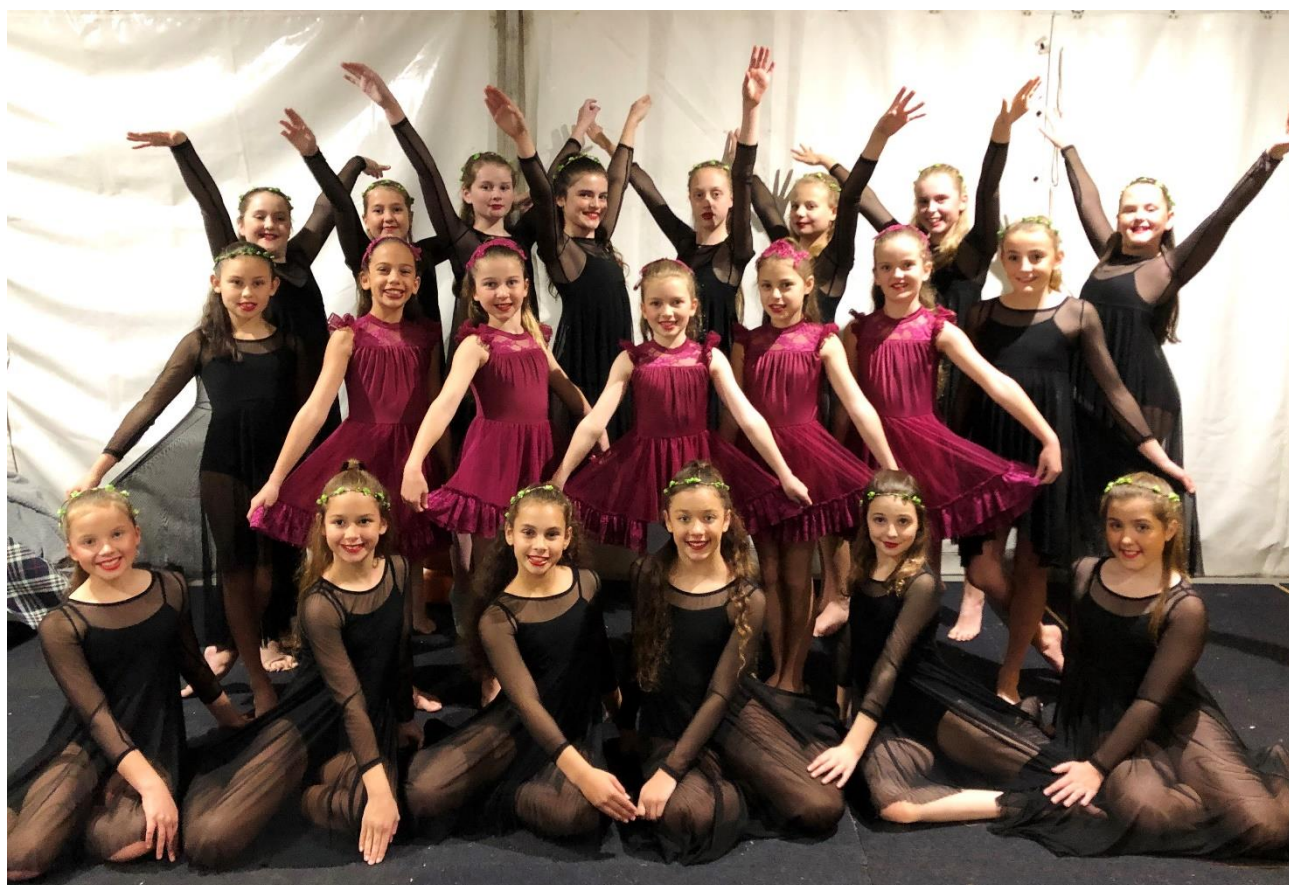
Stage 3 Dance Group