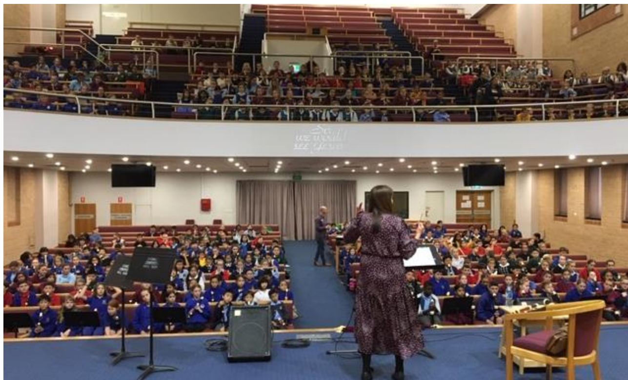
UBPS recorder group rehearsals at the Opera House