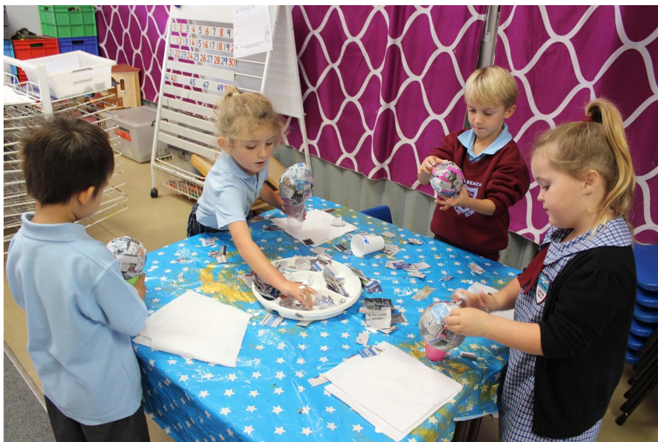
Students in KJ enjoying a lesson in art