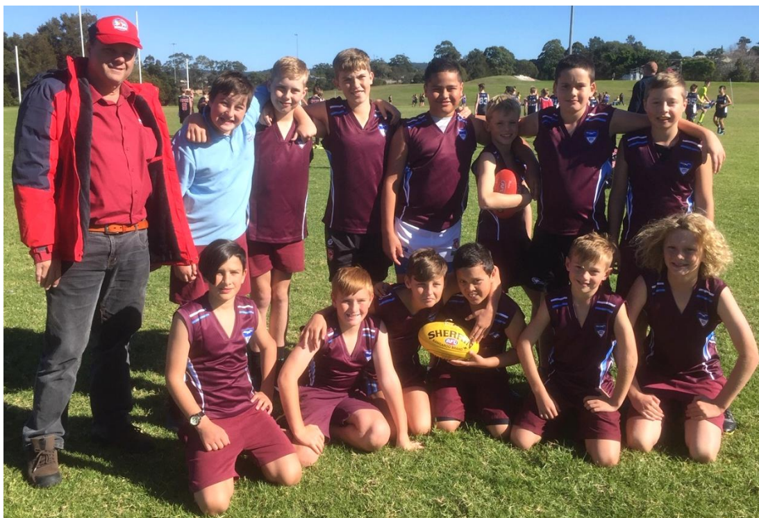
Our boys AFL team

We remind you to label all clothing. Jumpers and jackets get taken off during the day and suddenly parents are searching for their child's lost uniforms. Apart from being costly to replace, a lot of time is spent looking for these items. If names are on uniforms we can easily return them to students.