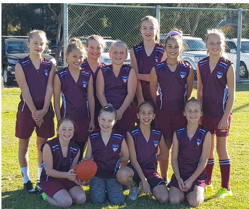
Our girls AFL team