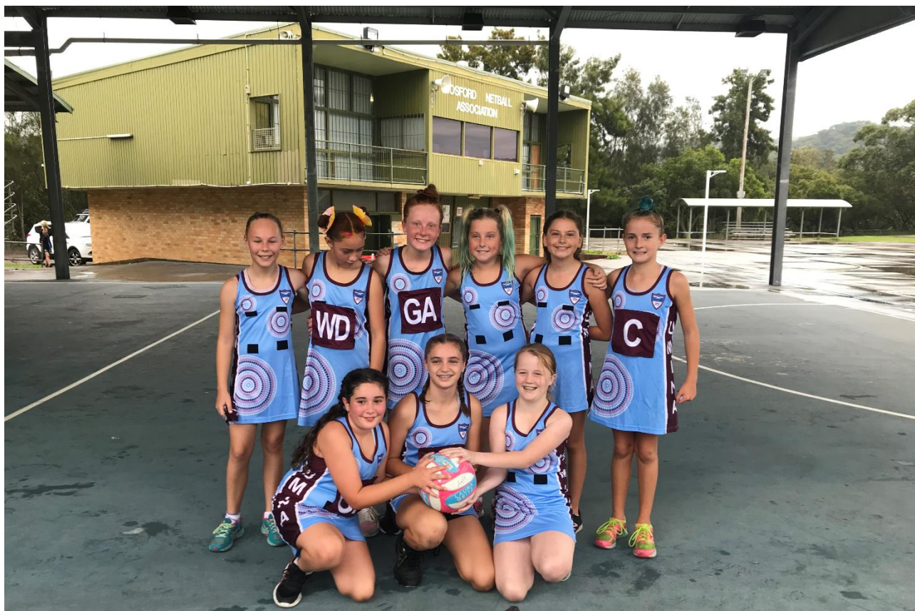
Umina Beach PS Netball team