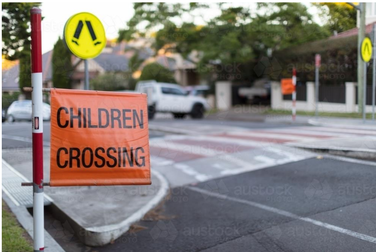
New rules for Sydney Ave