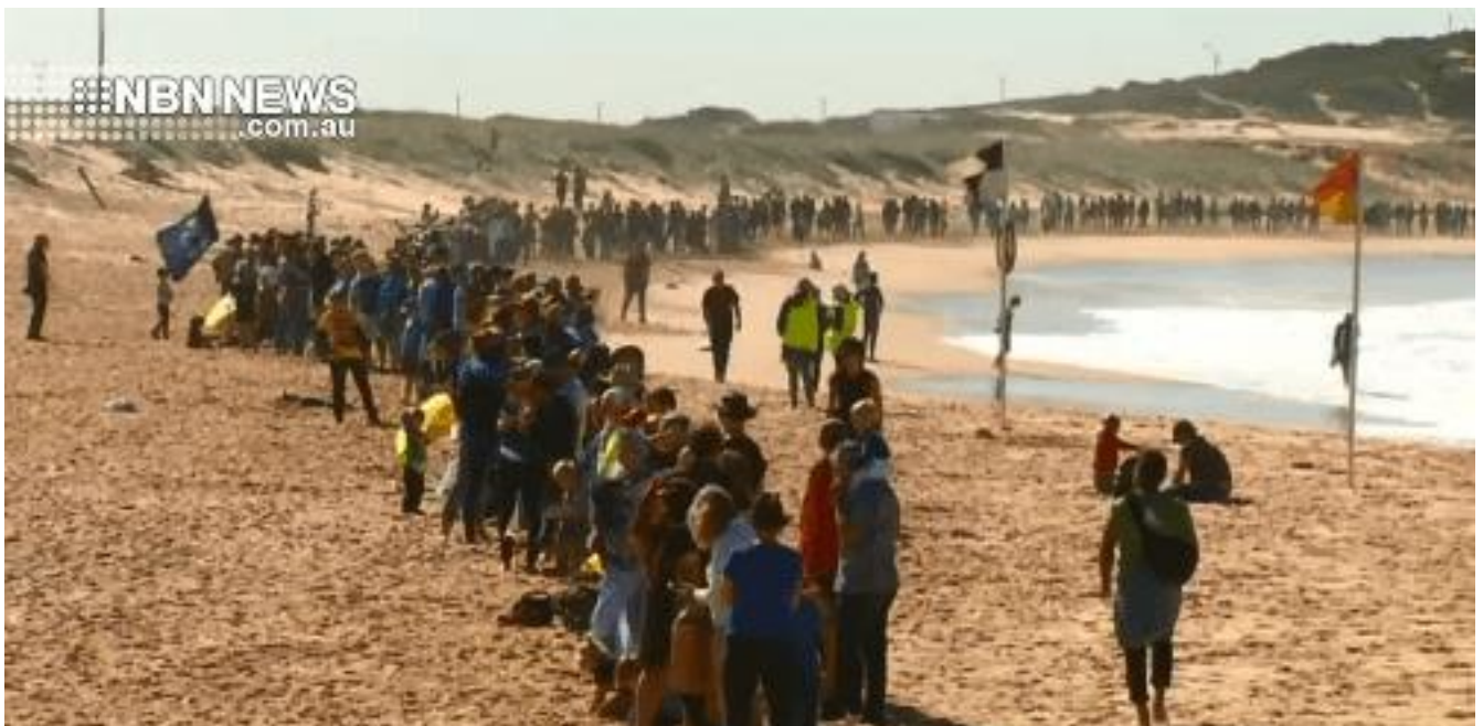
Previous 'Hands Across the Sand' at Newcastle

Join our Facebook page and stay informed – Save Our Coast