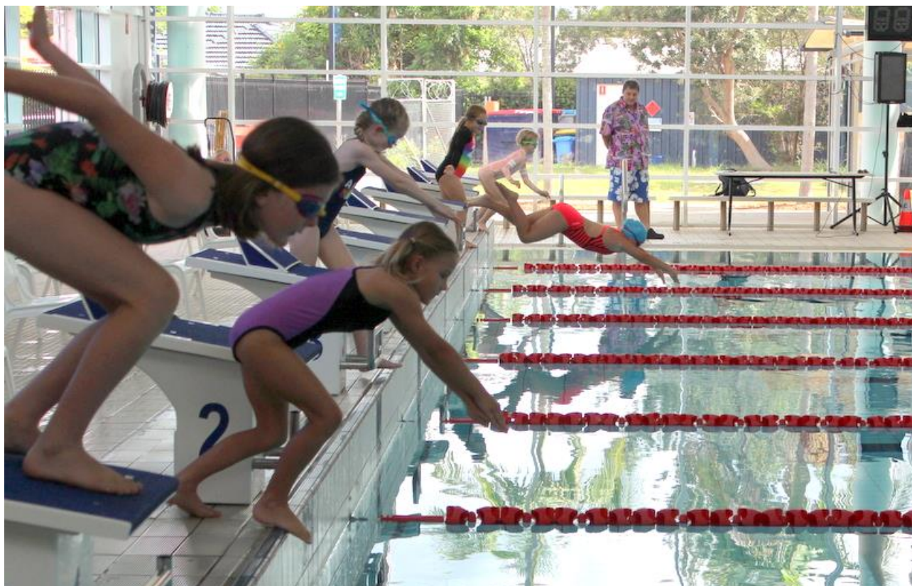
Our annual Swimming Carnival

Term 1, Week 5 Tuesday 26 February, 2019