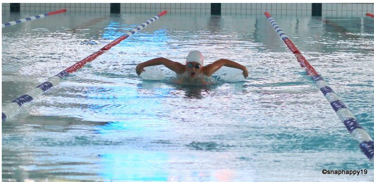
Our annual Swimming Carnival

Term 1, Week 4 Tuesday 19 February, 2019