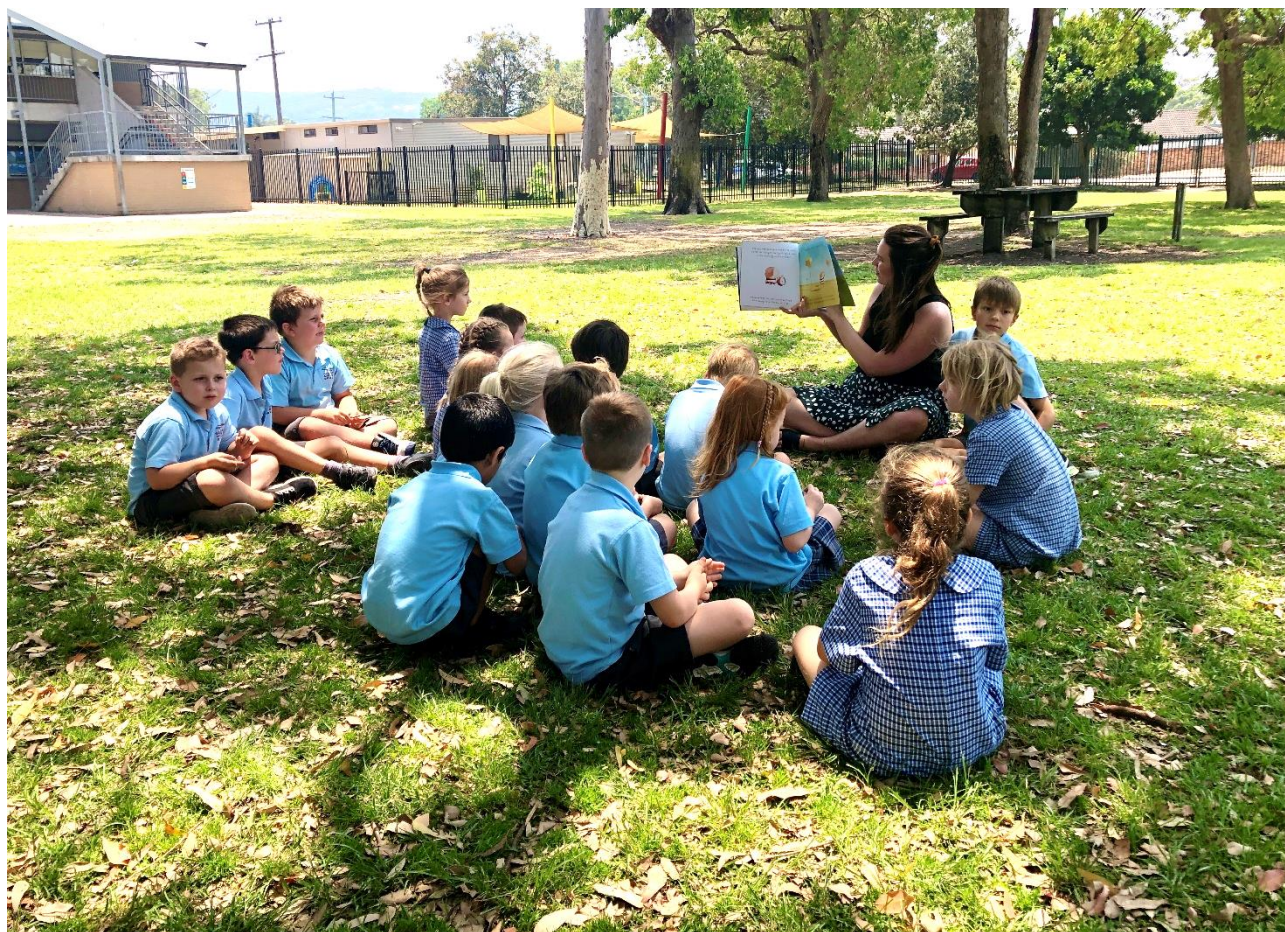
KF reading in the leafy surrounds